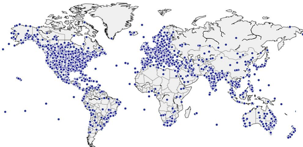
World Map of Single or Group Sightings

This map represents the density of UAP single or group sightings throughout the world. According to the statistics, the most frequent sightings are occurred in the USA and Western and Central Europe, which are considered to be the most developed parts of the world.