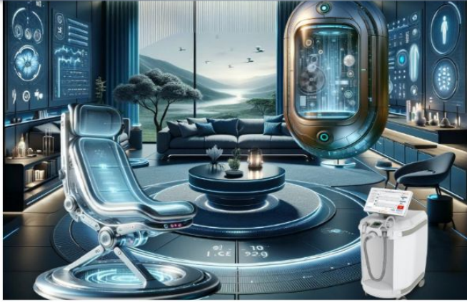
Longevity Biohacking Room