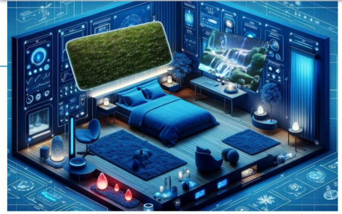
Longevity Sleeping Room