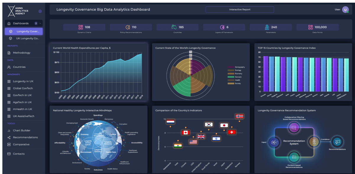
Longevity Governance Big Data Analytics System and Dashboard

Longevity Governance Big Data Analytics System and Dashboard is designed to support, monitor, analyze, benchmark and forecast governmental decision making and population health optimization, and to compare best practices in Longevity Governance and the most progressive national healthcare systems.