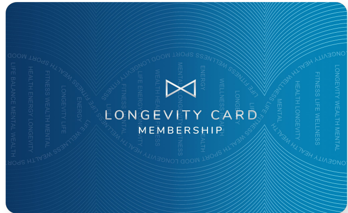
Longevity Club Membership Card