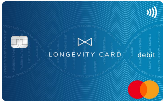
Longevity Banking Card