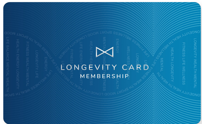
Longevity Club Membership Card